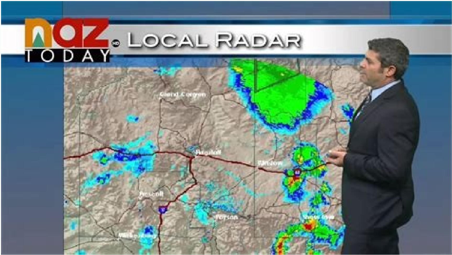
10-day weather report for flagstaff arizona.